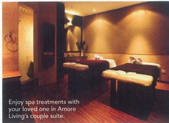
Enjoy spa treatments with your loved one in Amore Living's couple suite.

What's new: The Amore Living concept store at Tampines 1, which provides holistic wellness and fitness