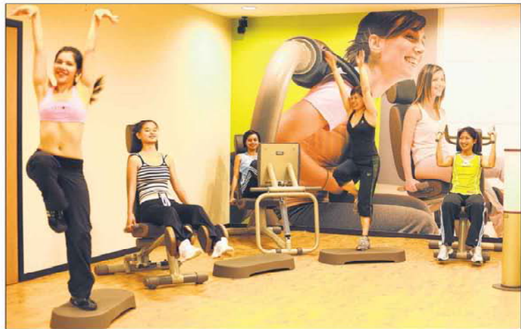
AT EASE: Women can focus on working out without distractions or worrying about their appearance at gyms where men are not allowed.