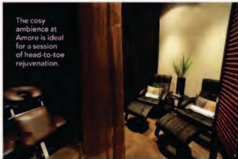
The cosy ambience at Amore is ideal for a session of head-to-toe rejuvenation.

WHERE: Amore Boutique Spa is located in Amore Bodydefine at Liang Court, #01-22. Call 6339-7822 for more enquiries.